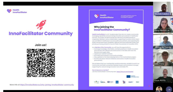
Health InnoFacilitator Community launch event, 21 June 2023

Lastly, on the 18th and 19th of October, project partners convened in Ivrea (IT) for the annual consortium meeting hosted by Bioindustry Park Silvano Fumero. This in-person gathering provided an opportunity to delve into the progress and outcomes of various Work Packages and plan activities for the project's second and final year.