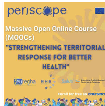
PERISCOPE MOOC on Strengthening territorial response for better health

On 8 September, the project concluded its journey with its Final Conference “ From Data Science and Socio-Economic Research to Policy and Technology – Learning from COVID-19 to Build Better Health and Care in Europe ”, where EUREGHA actively contributed to the panel on the future of public health in the European Union. The event was the occasion to delve into the outcomes and findings from the research on socio-economic and behavioural impacts resulting from the policies, as well as the project’s tools and resources.