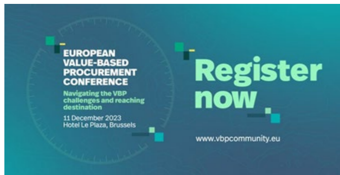
European Value-Based Procurement Conference, Brussels (11 December 2023)

The proliferation of high-quality pilot projects in recent years has underscored the potential of embedding value considerations within procurement practices. While these initiatives have served as beacons of inspiration, they have also illuminated the intricate challenges inherent in system-wide transformation. The overarching objective of the VBP Community of Practice is to transition from viewing pilot endeavours as exceptions to making value-based procurement the prevailing norm. Although this transition remains a work in progress, both speakers and attendees expressed a unified commitment to expediting progress towards this collective goal.