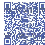
Discover our Booklet here