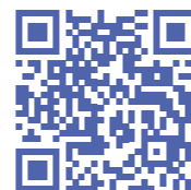
Annual Conference event highlights