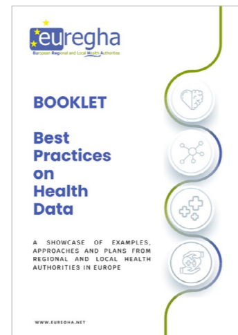
Booklet on Best Practices on Health Data