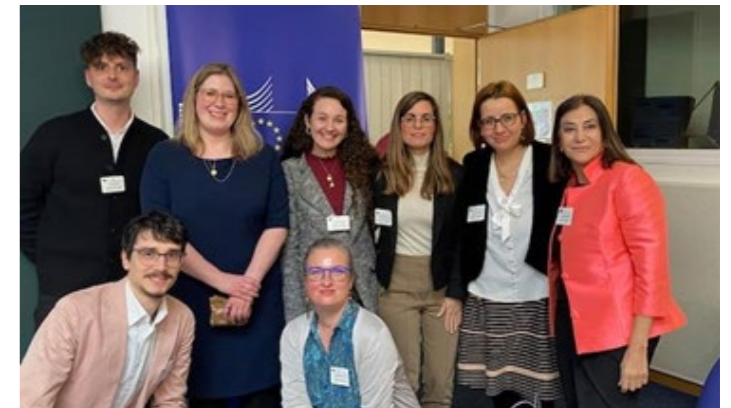
Group picture of Statement's core endorsers during the EU Health Policy Platform annual meeting in Luxembourg, 19 April 2023

support for knowledge exchange and the implementation of best practices in the field