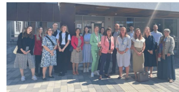
EUREGHA Annual General Assembly 2023, Linköping (SE), 12-13 June 2023

The Assembly also represented an opportunity to address and delineate the strategic orientation of the network through workshop activities. The first topic addressed was cross-border cooperation, recognized as a priority by members. Other priorities raised were the ageing population, health pro-