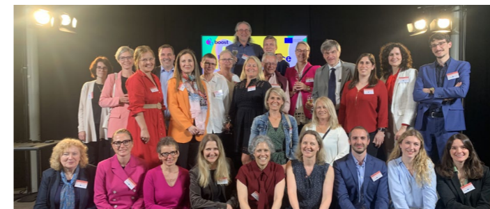
BOOST Team group picture at BOOST Final Conference, Brussels, 23 May 2023.

This contribution follows the response to the call for evidence submitted by BOOST in February 2023 and the featuring of BOOST as good practice in the European Commission’s Healthier Together – NCDs initiative published in June 2022.