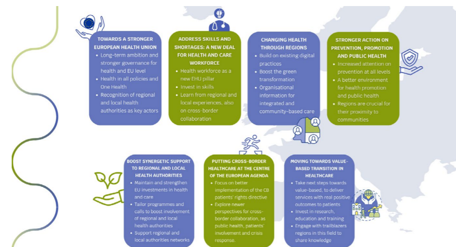
Pillars of the EUREGHA Manifesto for 2024 and beyond