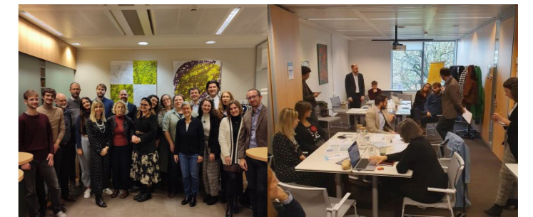
BeWell – First Workshop of the Large Scale Partnership for the Health Ecosystem, Brussels (22 November 2023)