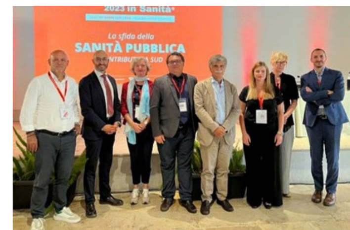
Session on Active and Healthy Living in the Framework of the Forum Mediterraneo in Sanità, Bari (22 September 2023)

EUREGHA has been suggested and selected by the HTP secretariat and DG REGIO as co-lead of the Health Working Group. EUREGHA will work with all other members of the WG , the HTP Secretariat and DG REGIO colleagues to carry forward the different planned activities until May 2026, boosting connections with key projects and initiatives such as the BeWell project and the Pact for Skills Large-Scale Partnership for the Health Ecosystem.