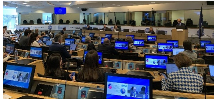
EUREGHA session at European Week of Regions and Cities, 11 October 2023, European Committee of the Regions

powering the healthcare workforce and creating more sustainable ecosystems.