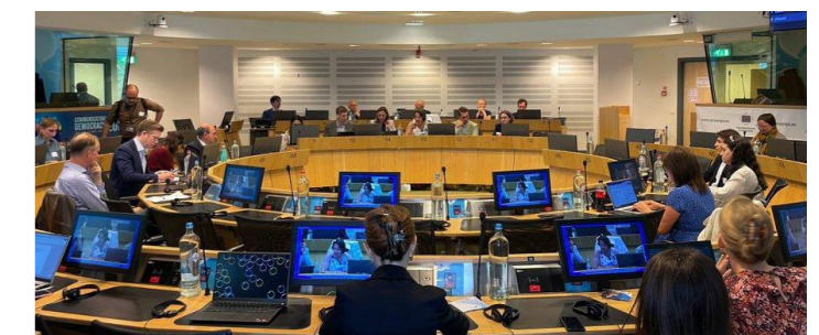
Meeting of the European Committee of the Regions' Interregional Group on Health and Wellbeing (CoR IRGHW), 6 July 2023