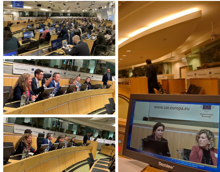
EUREGHA High-level Annual Conference 2023, Brussels (5 December 2023)

where speakers delved into critical issues shaping the future of health in the EU. Topics ranged from integrated care and multi-level governance to the pivotal roles of the healthcare workforce and health data. Participants actively exchanged insights, sharing experiences and best practices to underscore the importance of high-quality, comparable data and collaborative approaches across borders. In the closing remarks, it was emphasized the indispensable role of political commitment and foresight in shaping a robust and effective European Health Union. The pivotal role of regions in realizing this vision was underscored, emphasizing their unique capacity to drive innovation and advance health outcomes for all citizens.